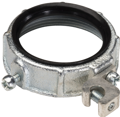
Material: Malleable Iron